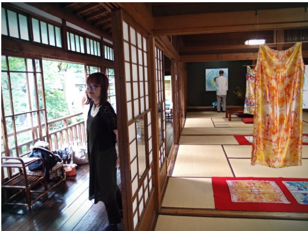
"Life sensation" art exhibition at Nanshoso, Morioka, Japan.

Tucked between modern houses and resting a block away from a Pachinko parlor, Nanshoso has survived and continues to be an attraction for locals and tourists alike. Stepping inside, you are transported somewhere else. You are sent back to the time when people still traveled by carriage, when the roads kicked up dust in the summer, and when rice paddies and fields made up most of what is now a well-known city.