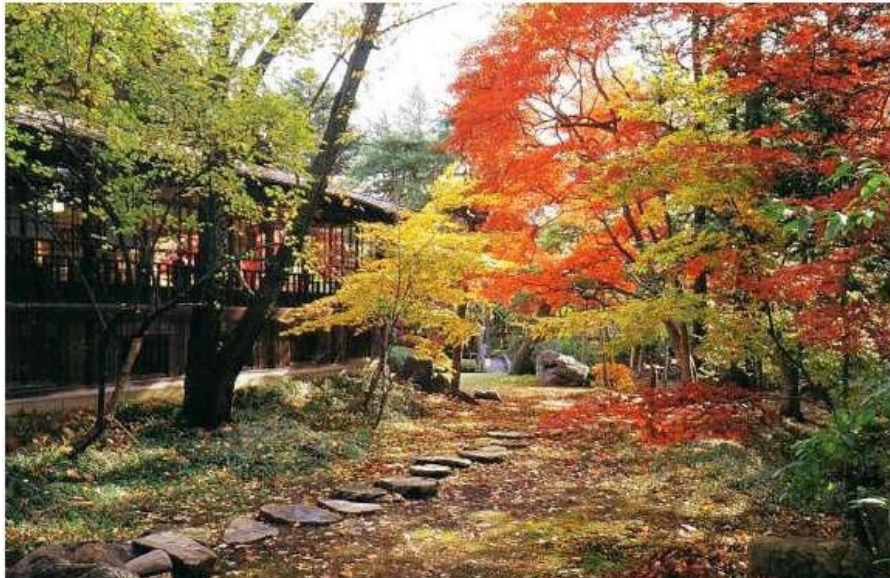
Garden of Nanshoso, Morioka, Japan.