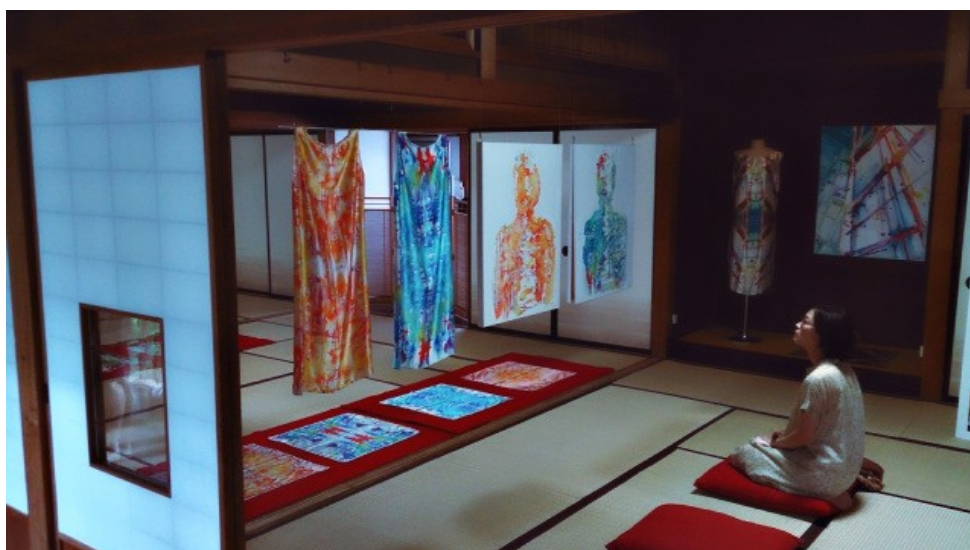
"Life sensation" art exhibition at Nanshoso, Morioka, Japan.

Nanshoso seems small from outside, but upon entering the visitors are amazed by how large it actually is, featuring corridors and multiple levels. The big exhibition room, with floor covered with tatami, overlooks a traditional Japanese garden. The garden looks unreal through the warped glass windows. It was created in chisen kaiyuushiki teien style, which means the garden features a path surrounding a pond, the type of garden often seen in Japanese advertisements and films. Chairs rest in the corridor, providing visitors with an opportunity to stop and enjoy the garden scenery. It is especially beautiful during hanami, when the cherry trees are in bloom, or during autumn, with the orange and red leaves reflected in the water. Without any doubt, a truly wonderful place.