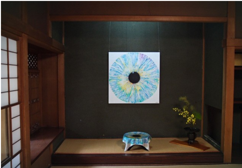
"Life sensation" art exhibition at Nanshoso, Morioka, Japan.

This series of oil paintings on canvas are dedicated to the sun, celebrating its energy, love and life, and its connection with humans and nature. "After all we share the same sun and sky and we should respect the rhythm of the nature and follow it in our lives."