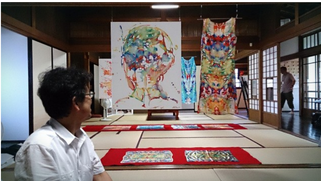
"Life sensation" art exhibition at Nanshoso, Morioka, Japan.

This exhibition presented a diverse range of colorful expressions of nature, human nature and the planet.