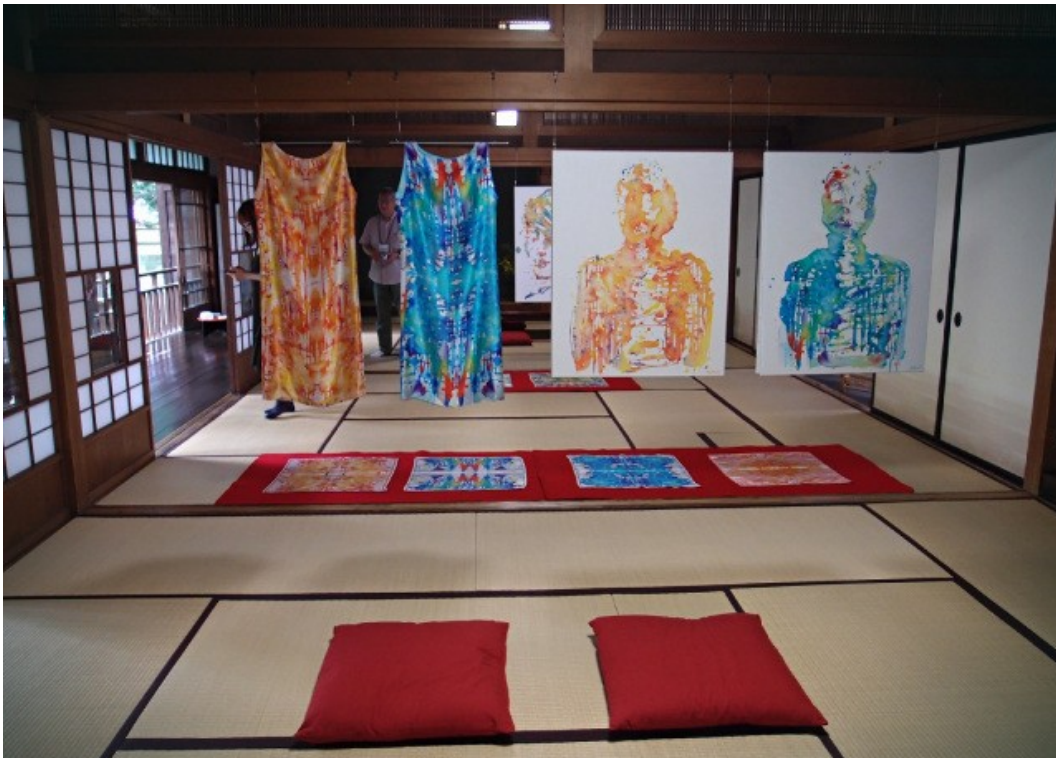
"Life sensation" art exhibition at Nanshoso, Morioka, Japan.