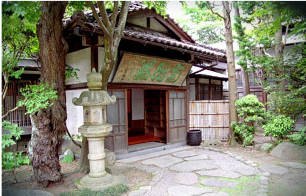
Nanshoso, Morioka, Japan.

Japan has a way of merge the traditional and the modern. It has found a way to grow around the old without destroying it, and Nanshoso Maison is a perfect example of this fact.