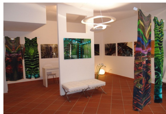
Exhibition at the Studio d'arte e architettura - Ana D'Apuzzo, Ascona, Switzerland, August 7 th -20 th , 2012 15 artworks and 4 dresses

STUDIO D'ARTE E ARCHITETTURA - ANA D'APUZZO Passaggio San Pietro · 6612 Ascona · Switzerland info@anadapuzzo.com www.anadapuzzo.com