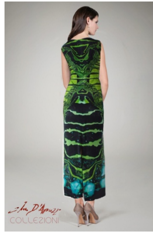
Dresses: VISION I & VISION II, 2012 Dresses in pure silk, ink drop digital printing Hand-made by the artist