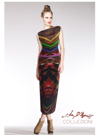
Dresses: POINT OF VIEW I & POINT OF VIEW II, 2012 Dresses in pure silk, ink drop digital printing Hand-made by the artist