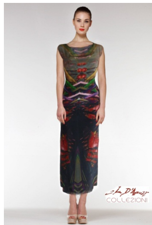
Dresses: POINT OF VIEW I & POINT OF VIEW II, 2012 Dresses in pure silk, ink drop digital printing Hand-made by the artist