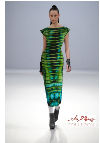
Dresses: VISION I & VISION II, 2012 Dresses in pure silk, ink drop digital printing Hand-made by the artist